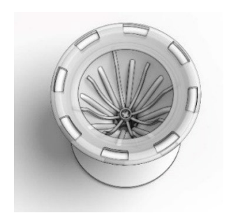
Figure 3: Delivery System